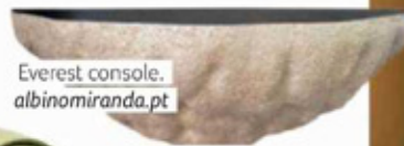
Everest console. albinomiranda.pt