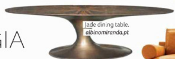
Jade dining table. albinomiranda.pt