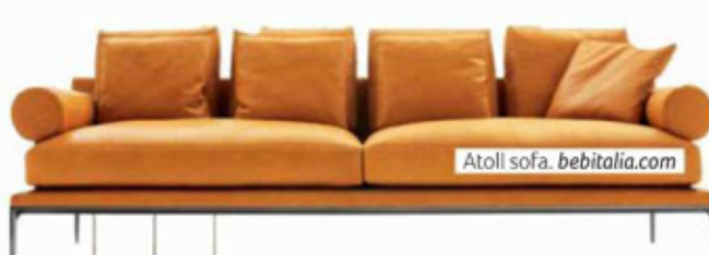
Atoll sofa. bebitalia.com

The Salone del Mobile showcases the latest and greatest furniture designs in visually stunning displays, along with quality craftsmanship and innovations. This year didn't disappoint with its celebration of captivating and intricate decorative details where retro designs took centre stage.