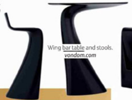
Wing bar table and stools. vondom.com