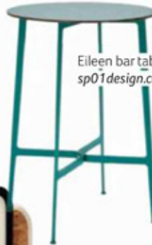
Eileen bar table. sp01design.com