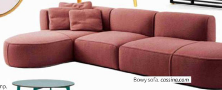
Bowys sofa. cassina.com