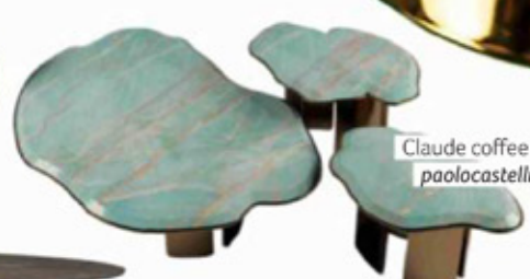
Claude coffee tables. paolocastelli.com