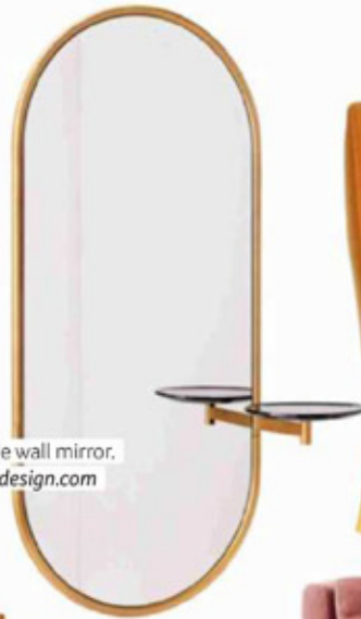
Michelle wall mirror. sp01design.com

Words Massimo Speroni