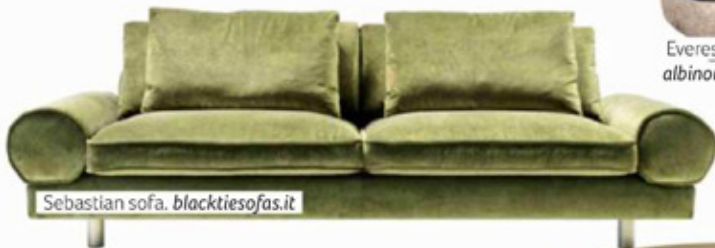
Sebastian sofa. blacktiesofas.it