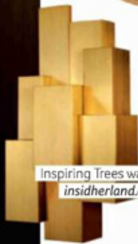
Inspiring Trees wall lamp. insidherland.com