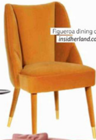
Figuerola dining chair. insidherland.com