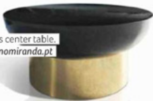
Lotus center table. albinomiranda.pt