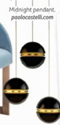
Midnight pendant. paolocastelli.com