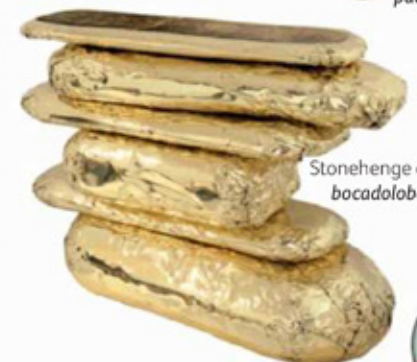
Stonehenge console. bocadolobo.com