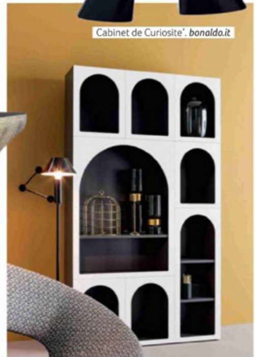
Cabinet de Curiosite'. bonaldo.it