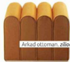
Arkad ottoman. zilioaldo.it