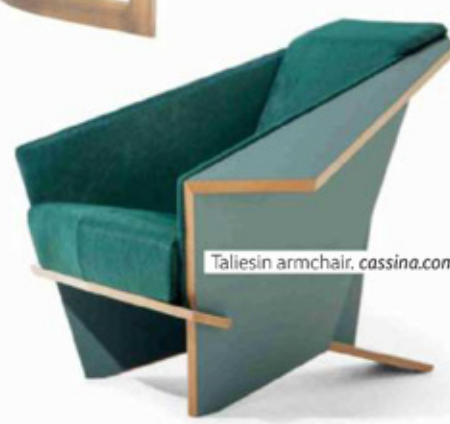
Taliesin armchair. cassina.com