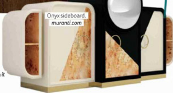
Onyx sideboard. muranti.com