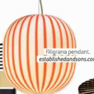
Filigrana pendant. establishedandsons.com