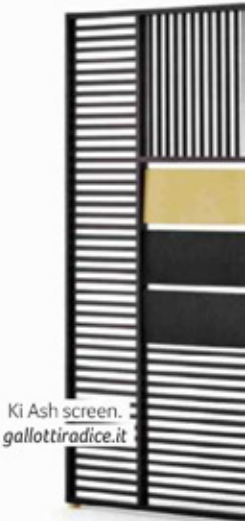
Ki Ash screen.