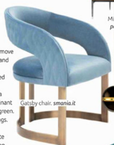
Gatsby chair. smania.it

Overall, the well-structured designs on show married comfort with quality and aesthetic appeal, with an unusual edge.