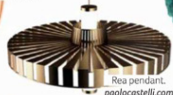
Rea pendant. paolocastelli.com